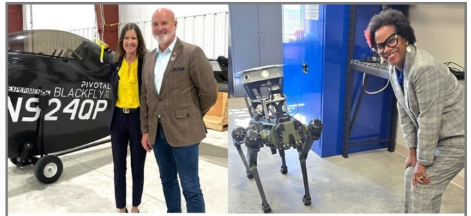
Members of the House Veterans & Military Development Committee traveled to Springfield on October 20 to visit and tour National Air Mobility Center of Excellence.